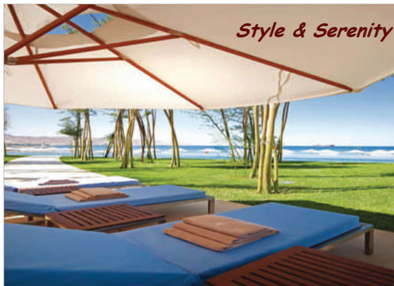
Style & Serenity

The new Holiday Inn Resort Dead Sea has officially opened its door on the 29th of September 2009. Situated at the lowest point on earth, overlooking one of the world's most magical seas and one of the most spectacular natural and spiritual landscapes, at the shore of legendary Dead Sea the resort offers the service and luxury accommodations one deserves! Between the period of 01st October—15th November 2009 the resort is offering special opening prices including breakfast. These special offers are subject to availability and can be availed via bookings through Karma House Jordan!